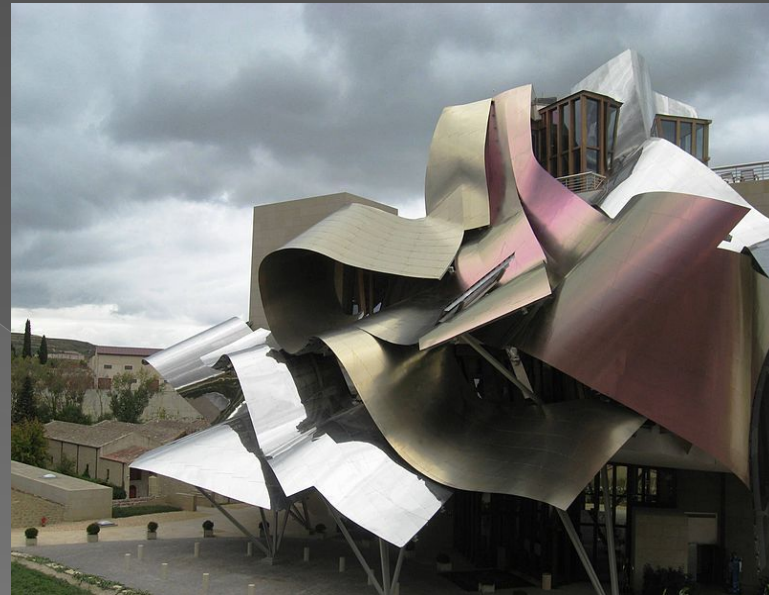
Marqués de Riscal Hotel, Spain (Designed by Frank Gehry)