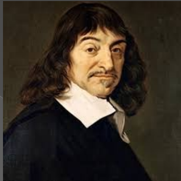
René Descartes (1596-1650) RATIONALISM