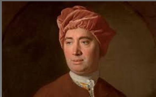
David Hume (1711-1776)