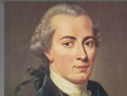
Immanuel Kant (1724-1804)