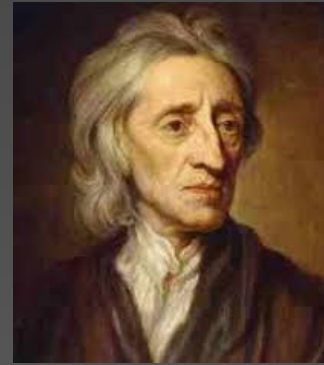
John Locke (1632-1704) EMPIRICISM