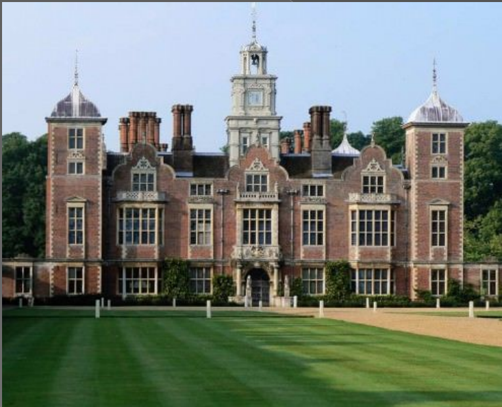
Blickling Hall, Norfolk, England