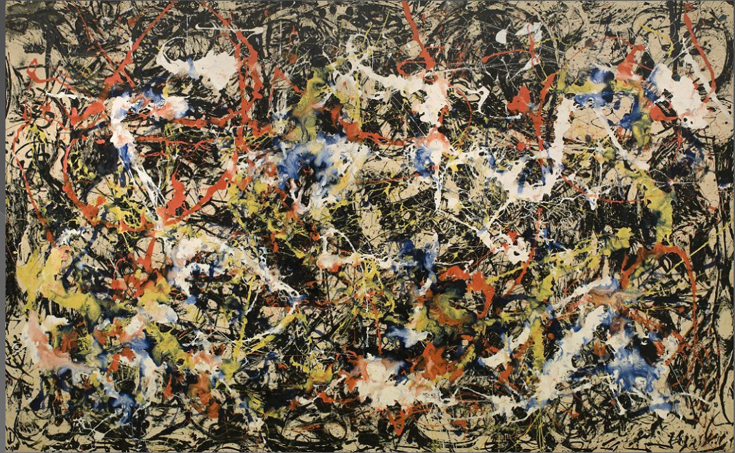
“Convergence” by Jackson Pollock (1952)