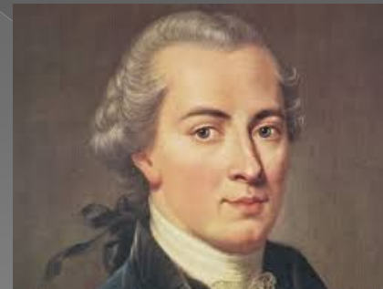
Immanuel Kant (1724-1804)