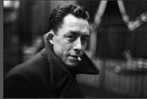
Albert Camus (1913-1960)