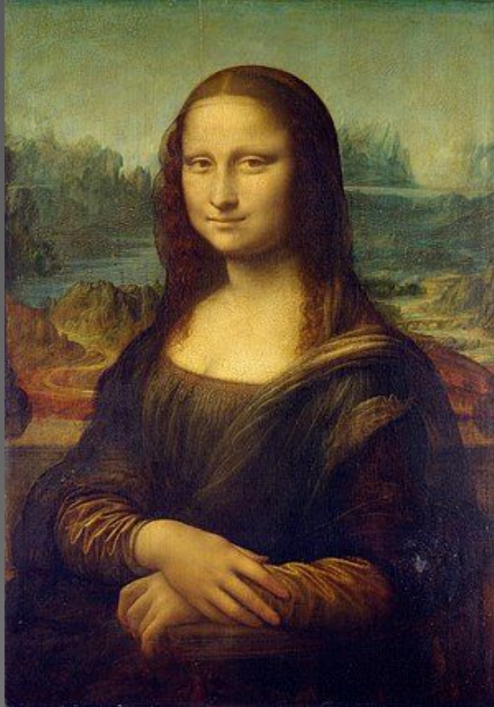
Mona Lisa by Leonardo Da Vinci