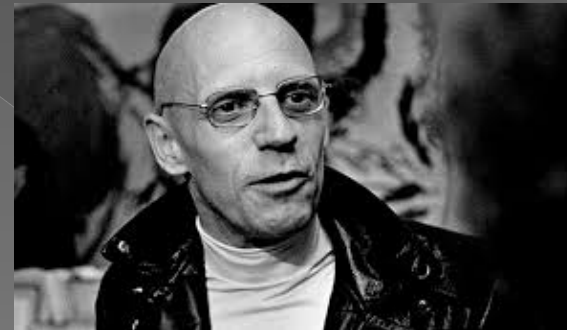
Michel Foucault (1926-1984)