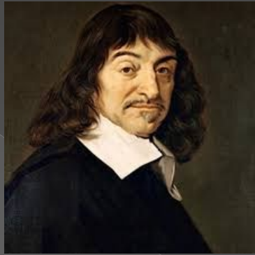
René Descartes (1596-1650) RATIONALISM