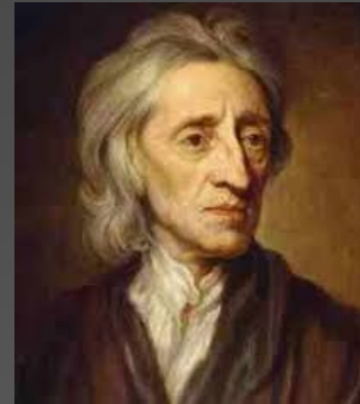
John Locke (1632-1704) EMPIRICISM