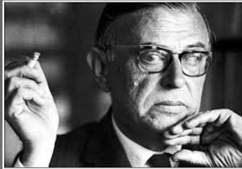
Jean-Paul Sartre (1905-1980)